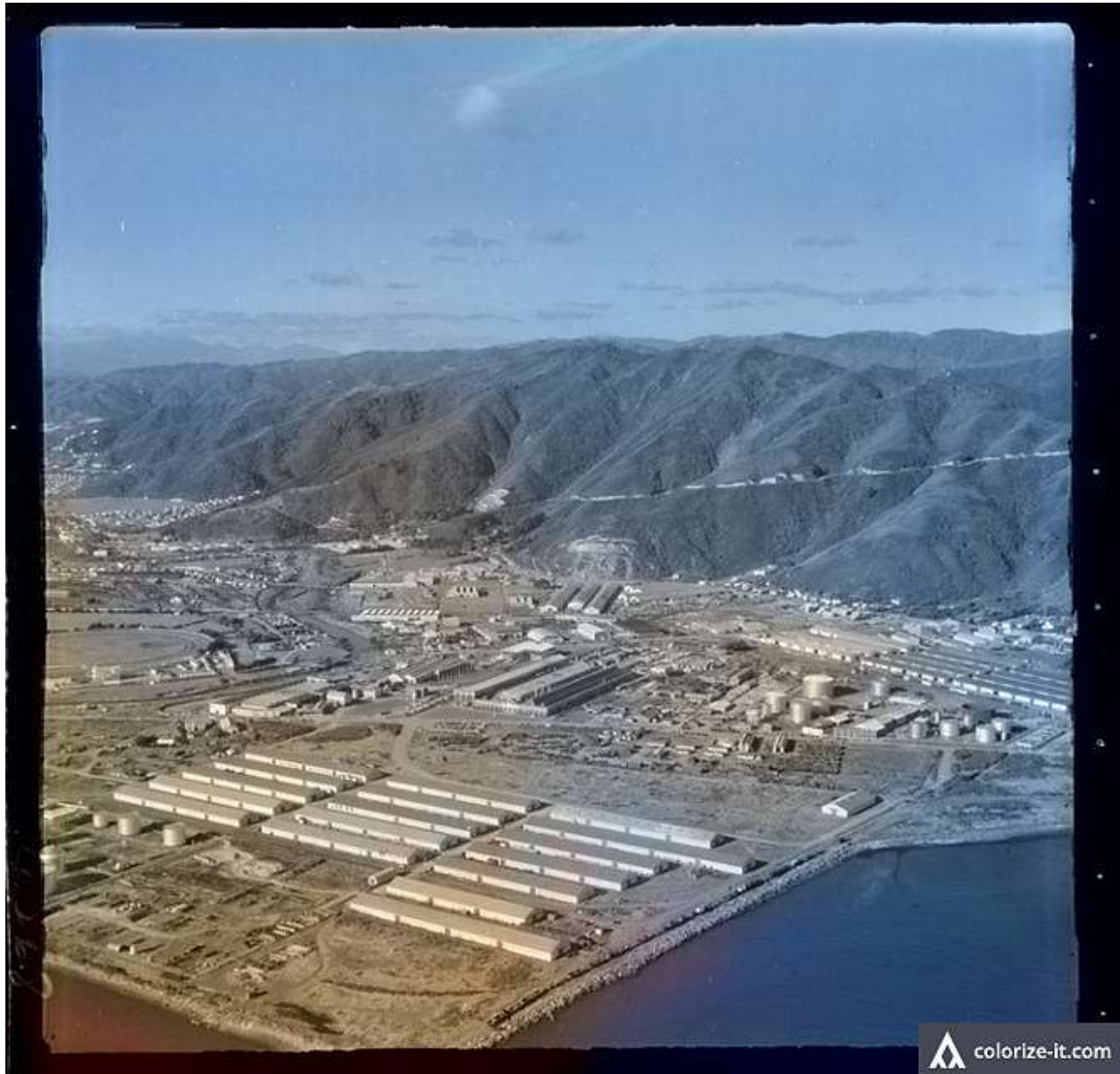
Seaview. Ford Motors Plant, fuel storage tanks and industrial buildings, Whites Aviation Ltd Photographs. Ref WA-41268-F. 21.3.56 Original image black and white. Colourisation by GD through colorize-it.com.