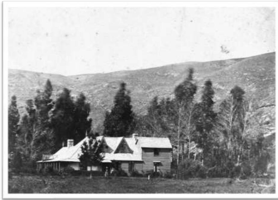
The Mason House, Taita, Lower Hutt c.1890.