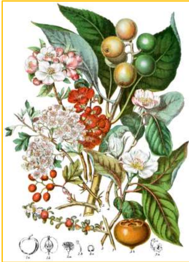
Pomaceae: The Apple Tribe.