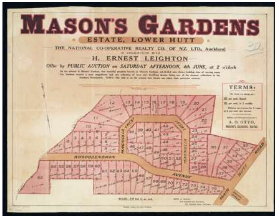
Mason's Gardens estate, Lower Hutt / [surveyed by] Beere & Seddon. 1921.